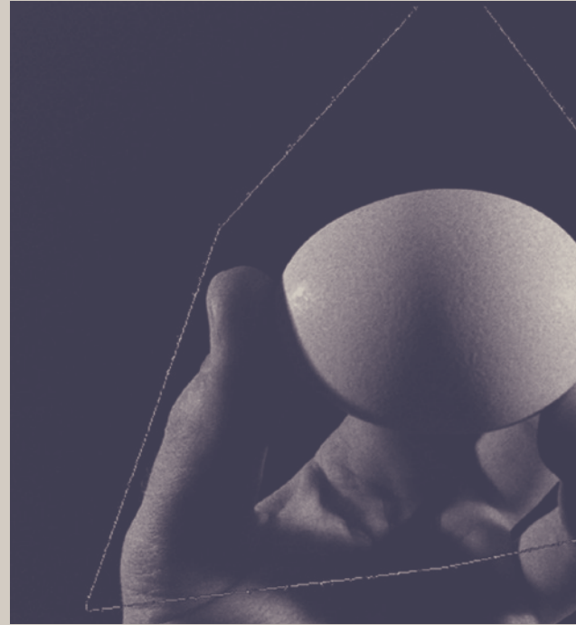
Notes from the Interior, courtesy of Ben Balcom