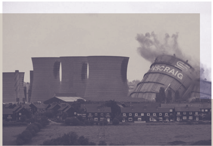
Conflicting Thoughts: Thoughts on Conflict

The 5th edition of Sheffield Fringe investigates 'documentary' film as an art object. It does so on the premise that thinking of and trading documentary as an object opens up the possibility of the 'objectification' of actuality. 'Objectification of actuality' here means using 'real' people, 'real' situations, the experiential – historically, or the here-lived-now – as a material resource in art production, comparable to the way a sculptor may use wood, metal or concrete as material. Put simply, when artists use actuality as a material, does this process always amount to objectification as a negative value? Or can we assign a positive value to this 'objectification impulse' and think of it as a necessary strategy in disrupting the assumed political agency of the documentary medium itself?