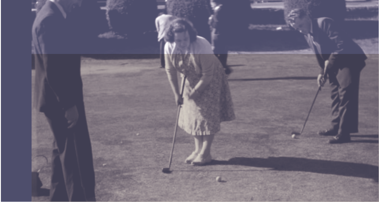
We See Ourselves, We See Each Other

Friday 10 June 6 pm Film programme: 70 minutes