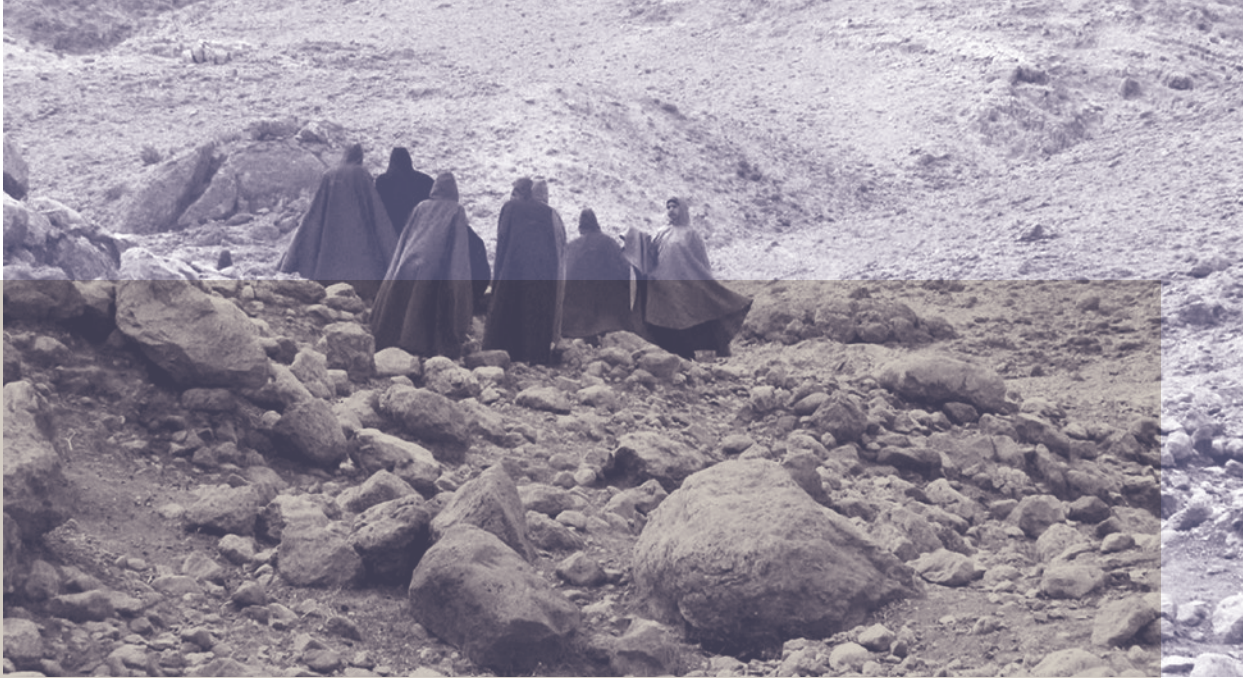
The Logic of the Birds, courtesy of Sarah Beddington