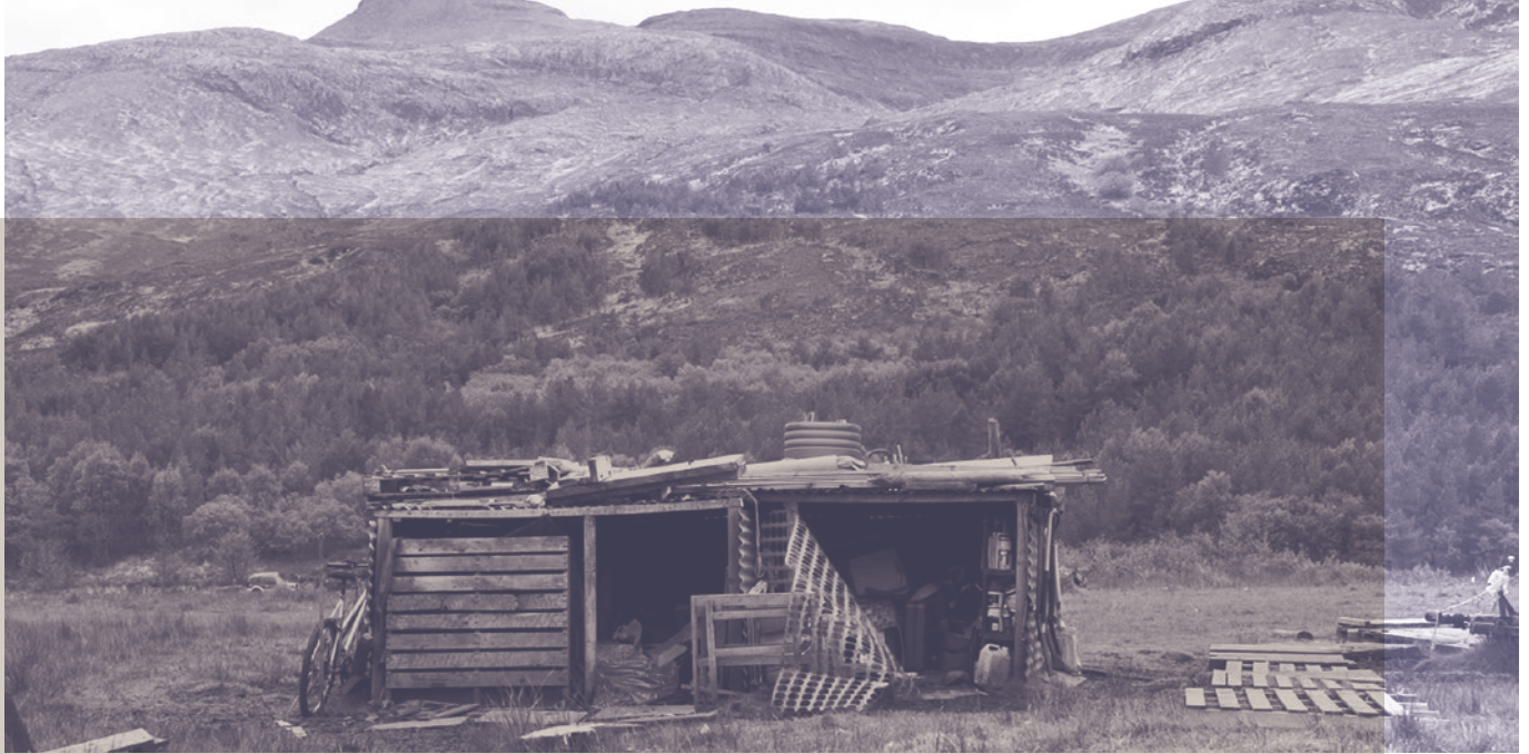
A Summer Voyage, courtesy of Alistair Macdonald

Sunday 12 June 4pm Film programme: 75 minutes + Artists' talk