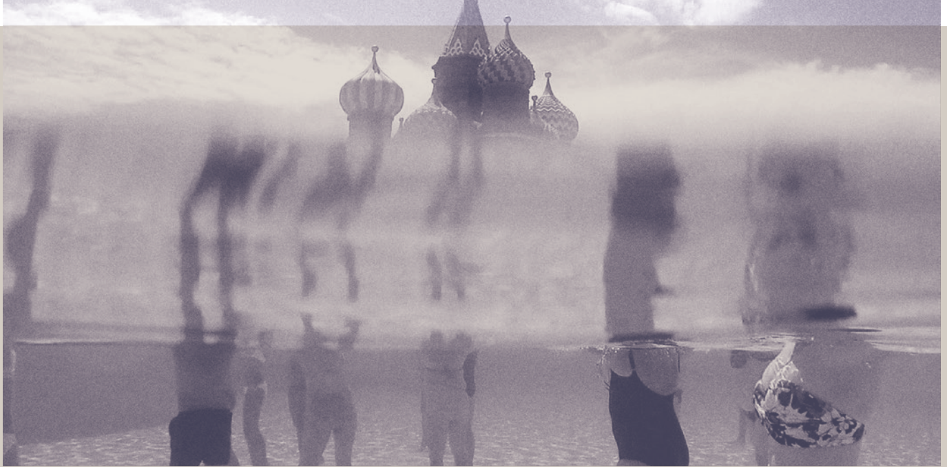
Exile Exotic, courtesy of Sasha Litvintseva

Saturday 11 June 6pm Film programme: 80 minutes + Reading