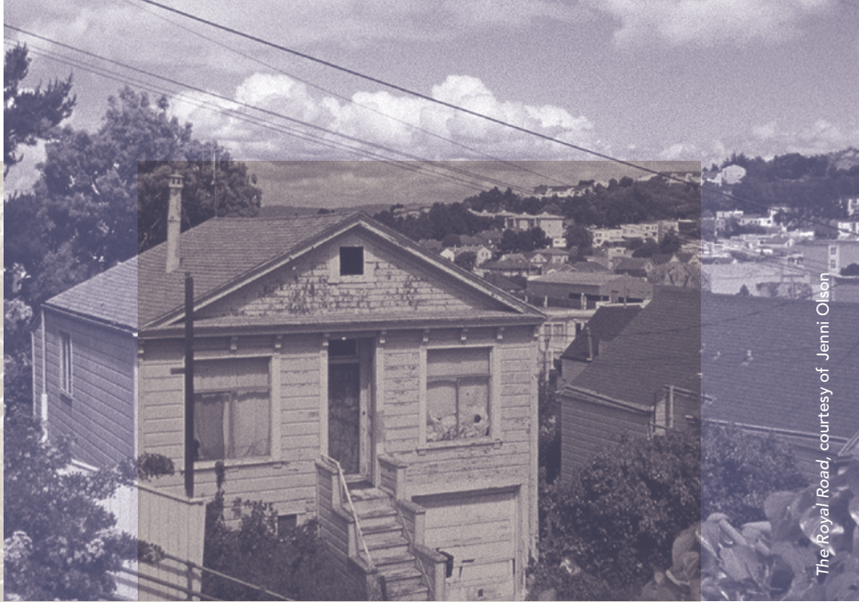
The Royal Road

Monday 13 – Saturday 18 June 2pm & 4pm daily Exhibition: film duration 65 minutes